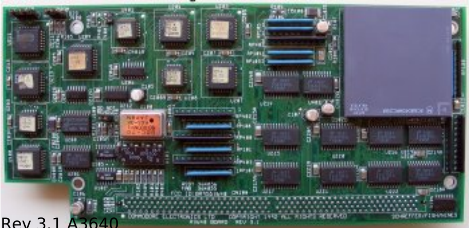
Rev 3.1 A3640